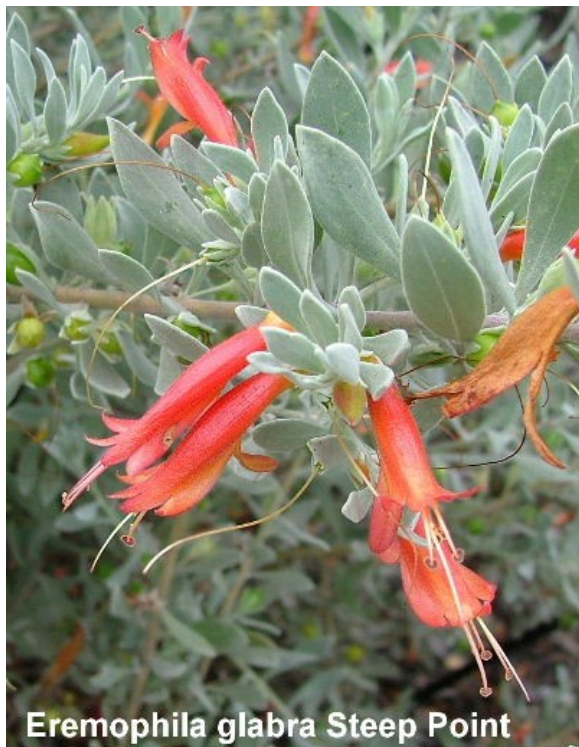
Eremophila glabra Steep Point