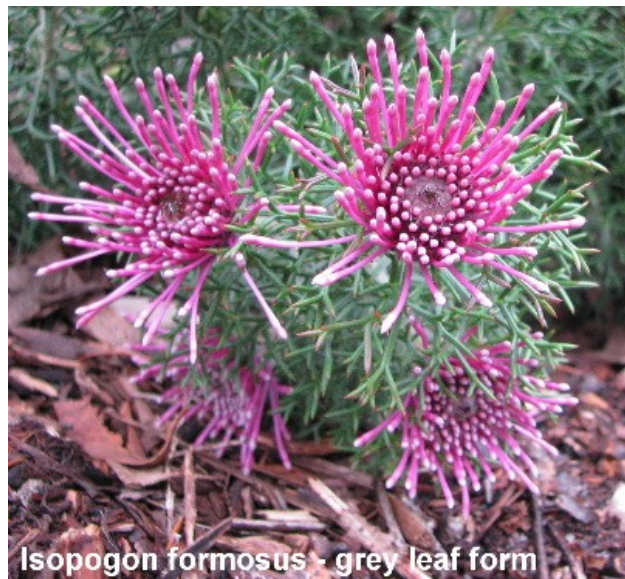
Isopogon formosus - grey leaf form

drained sunny or semi shaded site should suit this species. It can be propagated by cuttings or fresh seed. A green leafed form of this species grows much taller and is inclined to be a leggy shrub. It needs regular pruning to keep it bushy but the grey form is naturally dense and needs no shaping. Both forms come from South Western WA.